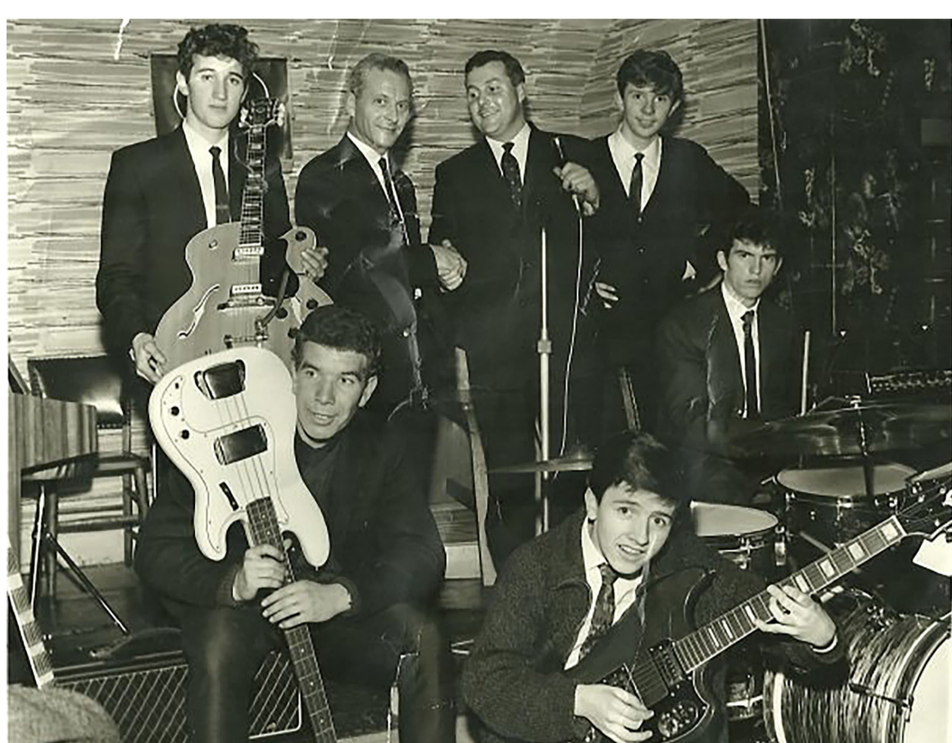
The Bystanders in Gamlins Music Shop Cardiff in 1962