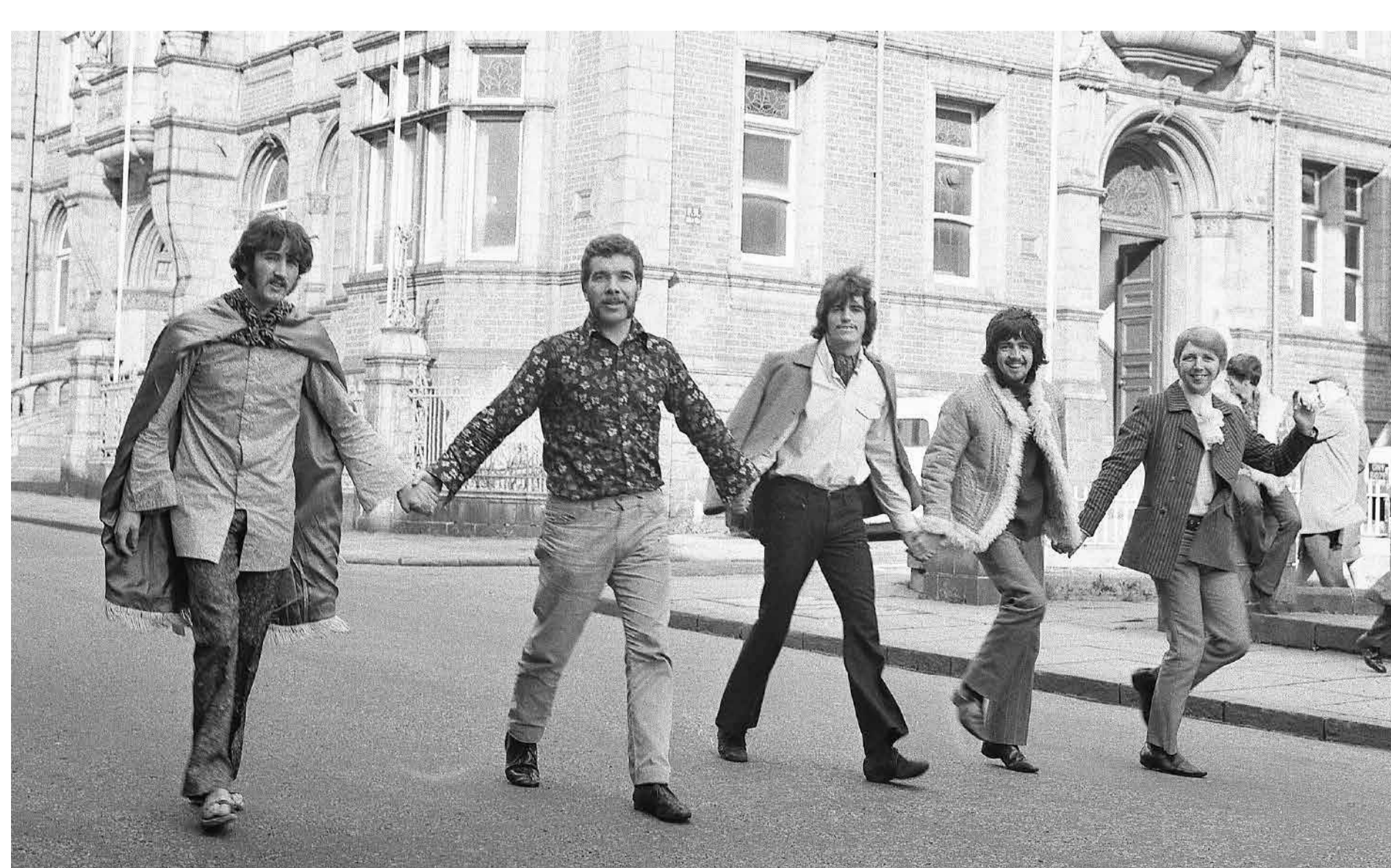
The Bystanders walking past The Town Hall (The Red House) in Merthyr Tydfil in 1967